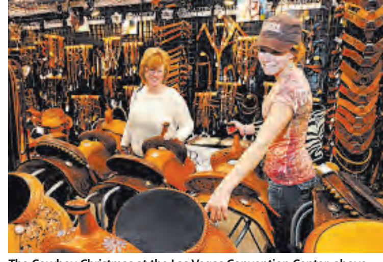
The Cowboy Christmas at the Las Vegas Convention Center, above and below right, features items for the western wear and country enthusiasts no matter where they live or how young they are.

NFR Event Celebration at 11 p.m. Party starts at 9 p.m.