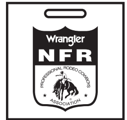
OFFICIAL NFR® MERCHANDISE CLEAR BAG