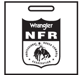
OFFICIAL NFR MERCHANDISE CLEAR BAG