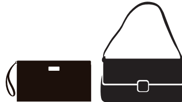
SMALL CLUTCH BAG/PURSE