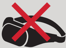
OPAQUE FANNY PACK