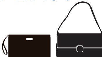
SMALL CLUTCH BAG/PURSE