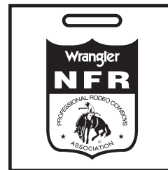
OFFICIAL NFR® MERCHANDISE CLEAR BAG